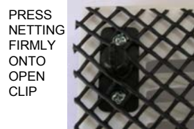
PRESS NETTING FIRMLY ONTO OPEN CLIP