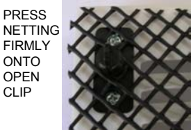
PRESS NETTING FIRMLY ONTO OPEN CLIP