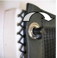
MOVEABLE TAB FACES DOWNWARD TO LOCK