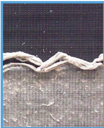
PreVent Wrap-Around filter 6 days after installation during cottonwood season.

When dirty, the PreVent can be cleaned off with a brush or hosed off with water while on or off the unit