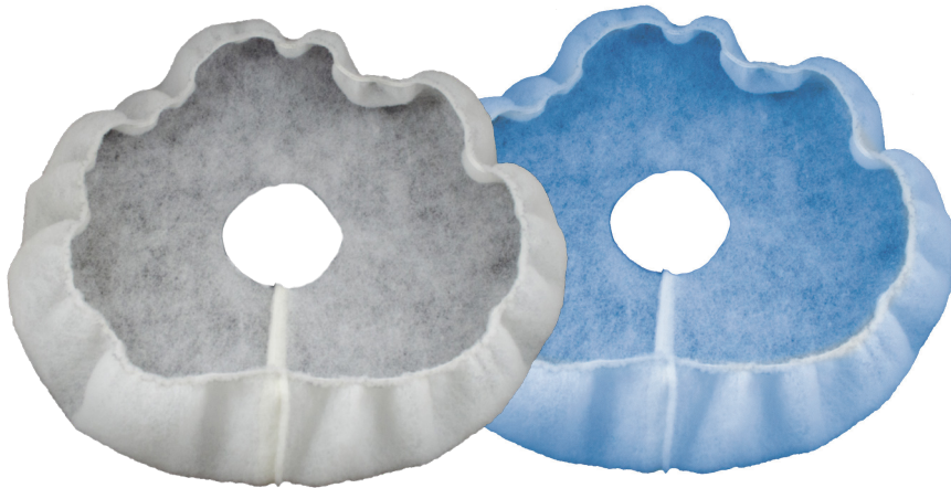
Dry type non-woven polyester