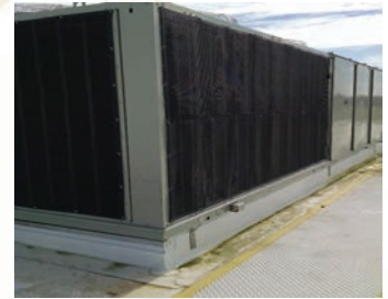
100 ton Trane Unit AFTER with durable, cleanable PreVent air filter screens