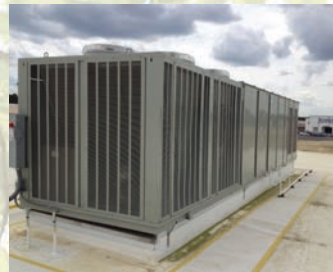
100 ton Trane Unit BEFORE

Preventative maintenance doubles the useful life of unitary equipment & reduces HVAC energy bills more than 20%