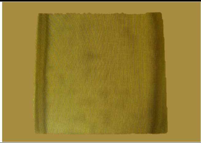
Air Flow vs Resistance

Manufacturer Permatron Filter Model BHA Media Part Number BHA9X9 Generic Filter Type Mesh Screen Nominal Dimensions (H x W x D) 24" x 24" x 0.1" Pocket / Pleat Quantity N/A Media Type Synthetic Est. Gross Media Area Standard Adhesive Type N/A